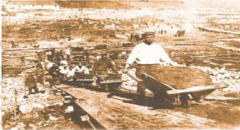
Gulag prisoners build a canal between the Baltic and White seas, 1932.