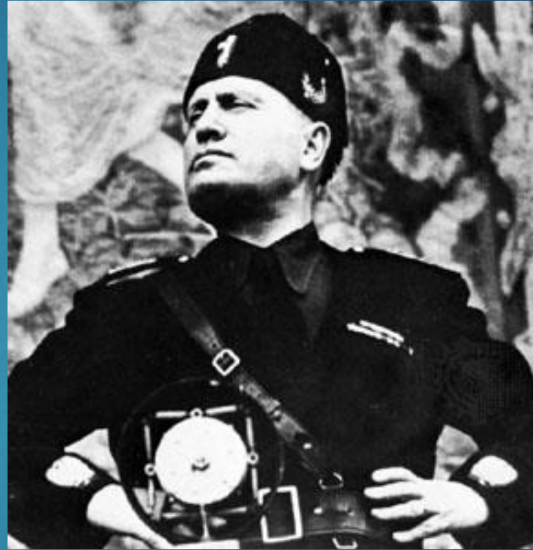
IL DUCE--THE LEADER