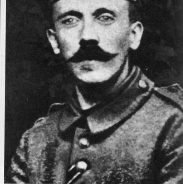
From soldier to Führer . These portraits illustrate the change in Hitler's face and moustache between the years of 1915 to 1921. (Left to right) Hitler pictured in 1915, 1916, 1919 and 1921.