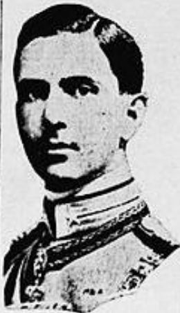
Crown Prince Humbert.

Consolidated Studios Are Swept by Flames Fatal to One—Master Pictures Burned Include Many New Talkie Productions.